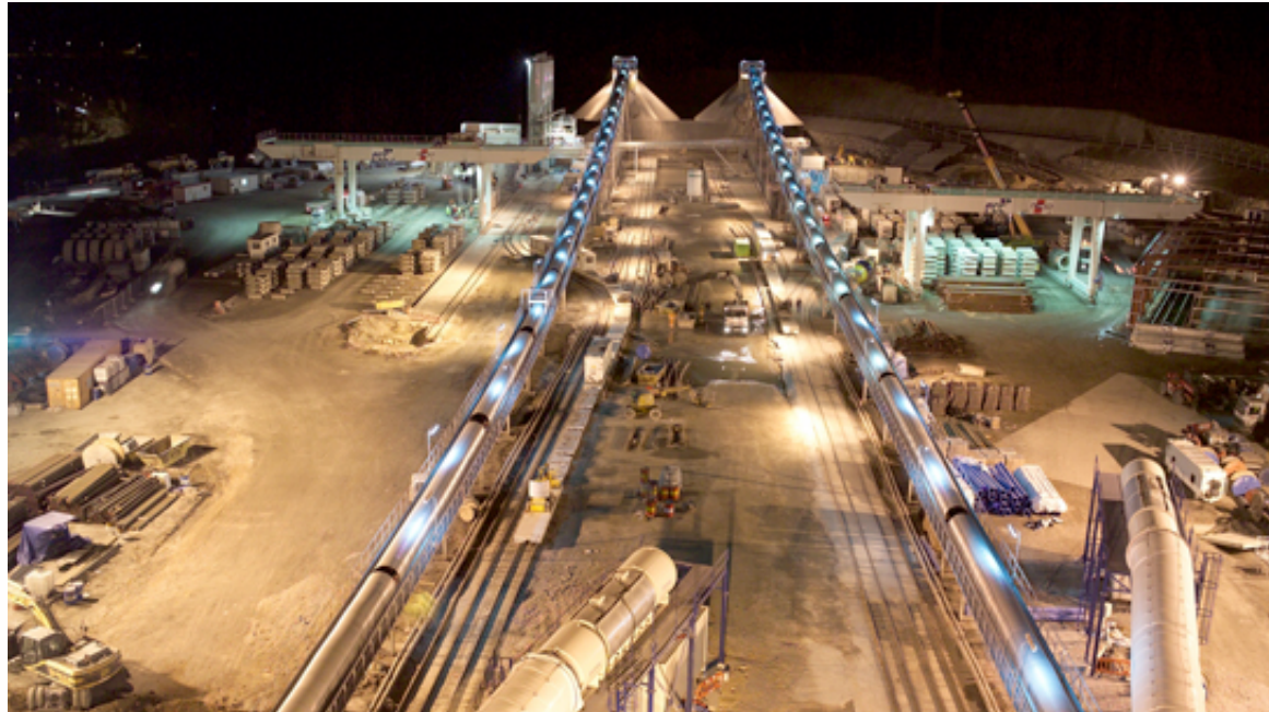
Rail sidings. Pajares tunnels

A new San Gothard tunnel is now being built between Switzerland and Italy which, with more than 50 km, will replace the one built over 100 years ago, measuring 18 km. The old tunnel had steep ramps to reduce its length and the new one is a base tunnel, for the reasons described above.