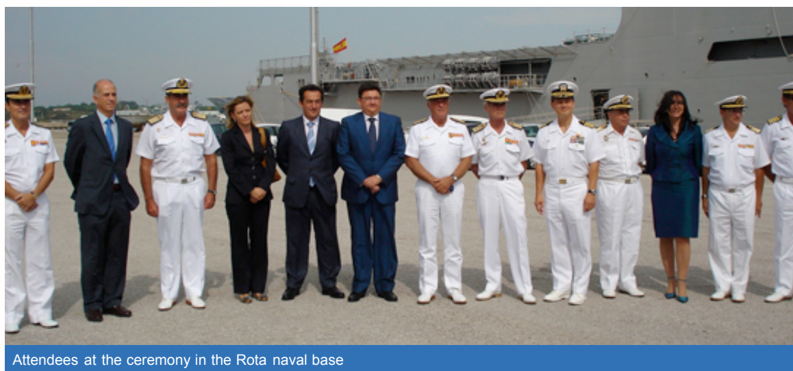
Attendees at the ceremony in the Rota naval base

Wharf 4 will provide the berth for the new Juan Carlos I aircraft carrier, to be built in El Ferrol.