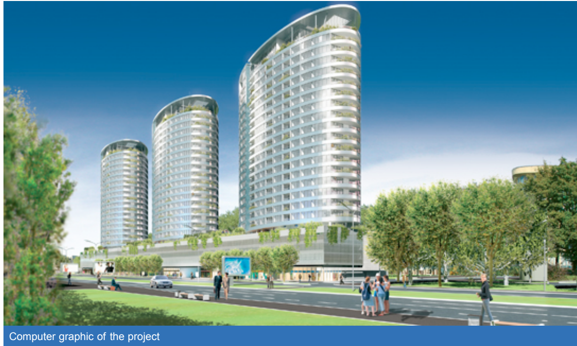
Computer graphic of the project

The company will build 633 homes with 24-hour reception, garage and fitness centre in each tower and shops on the ground floor. The contract - to be undertaken in a temporary joint venture with another company - is worth €49 million.