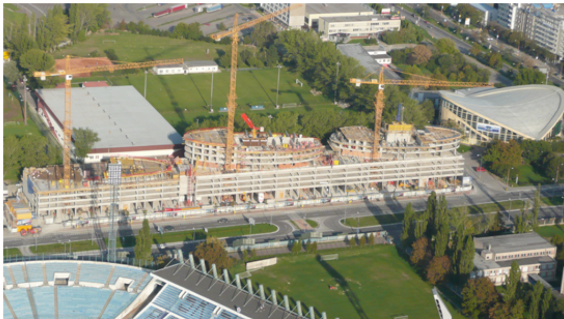
Current state of the project

Alpine will finish building the towers within two years. The first two will be handed over in Autumn 2008 and the third will be inaugurated at the start of 2009.