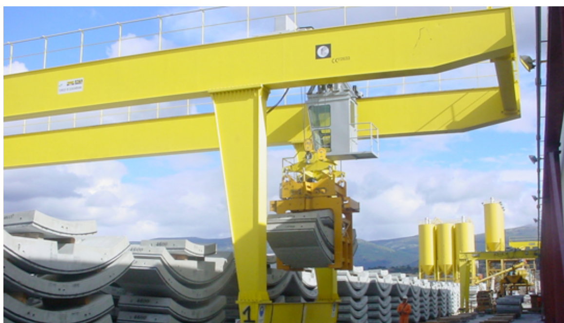
Segments stockpile. Guadarrama tunnels

As an example, the Guadarrama tunnel, two tubes 27 km long, were bored in four years with four machines. It is difficult to predict, but the same work with conventional methods would have taken at least 10 years, without including any problems in undertaking and safety.