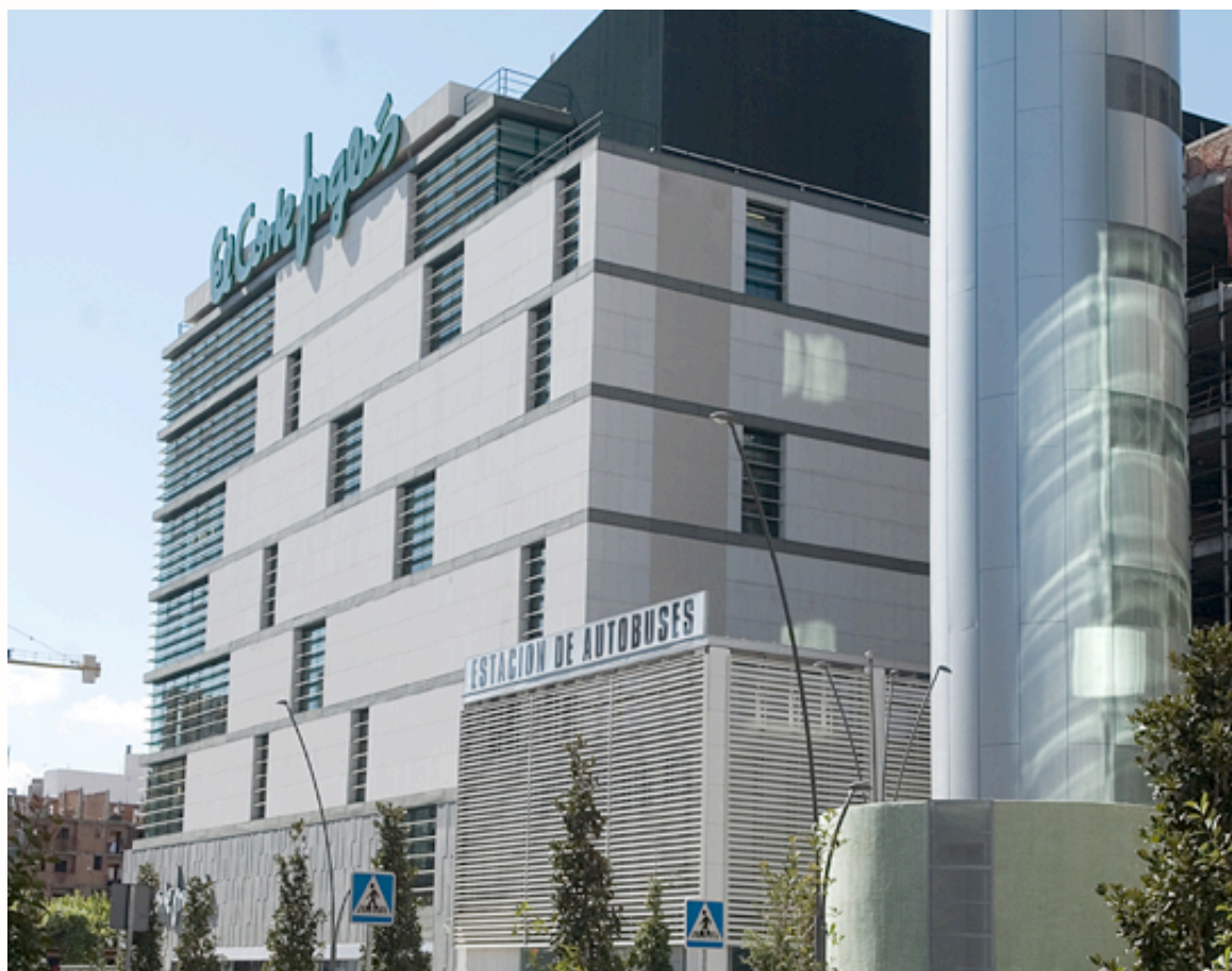
Shopping centre and bus station