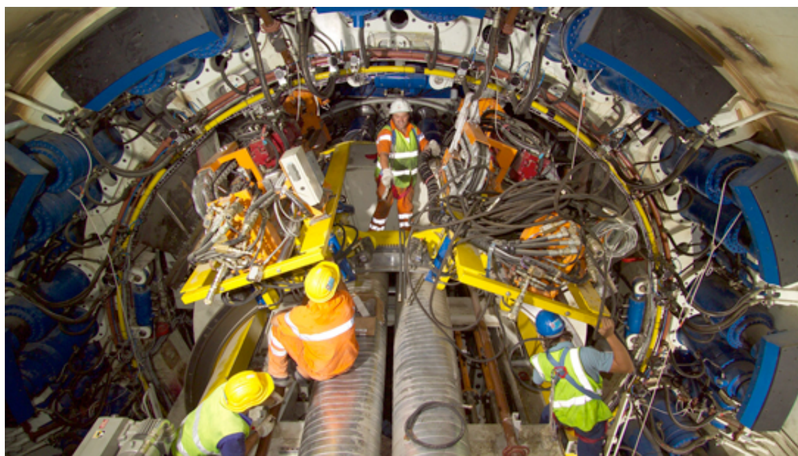
Installation of the tunnel boring machine head. Guadarrama tunnels

As with any other project, tunnelling demands respect and the adoption of the safety means within our reach but a tunnel should never be avoided because of fear of building it.