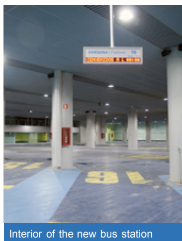
Interior of the new bus station

Ibérica de Servicios y Obras, SA, an FCC Construcción subsidiary, has built a new shopping centre for El Corte Inglés in Talavera de la Reina, Toledo, and has also built a new bus station next to it, together with access tunnels for the entire complex to link it with the surrounding landscaped area, also built by ISO.